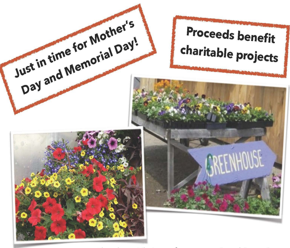
Thanks to Thrivent for supporting this project

Nice selection of bedding plants and hanging baskets