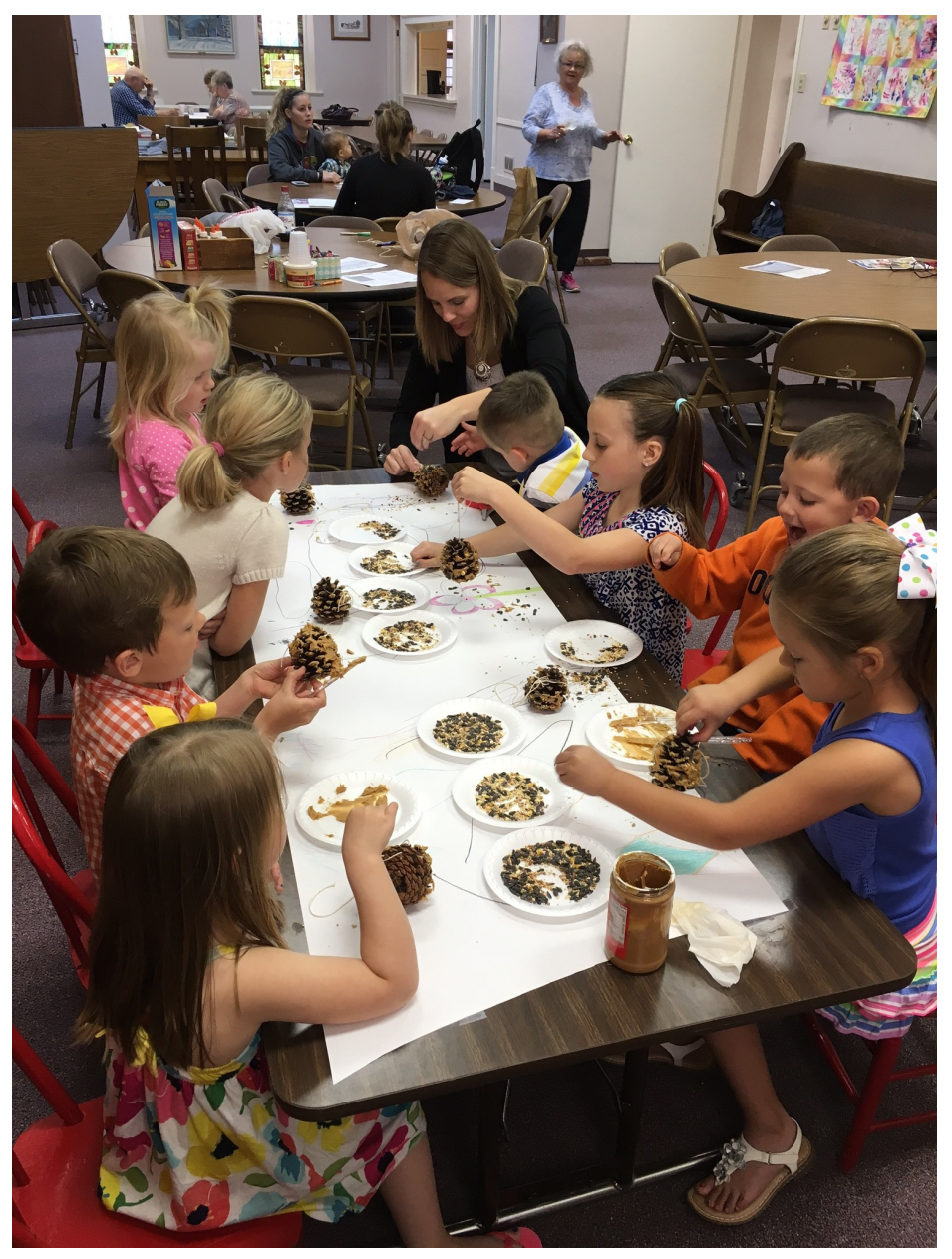
Thanks to everyone for a successful children's Sunday School year!

The photo below shows Walsburg Sunday School children having fun making bird feeders with pine cones, bird seed, and peanut butter. The children's upcoming Bible Stories include The Ascension, The Holy Spirit, and Paul's Letters. Sunday, May 22, will be the last day of children's Sunday School which will resume again in the Fall when the 2016-2017 school year begins.